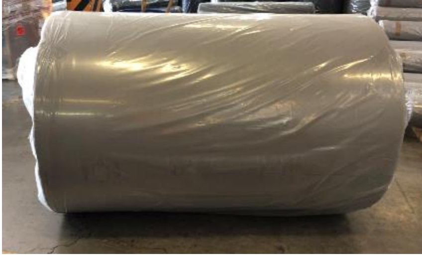
Foam 74 Kg