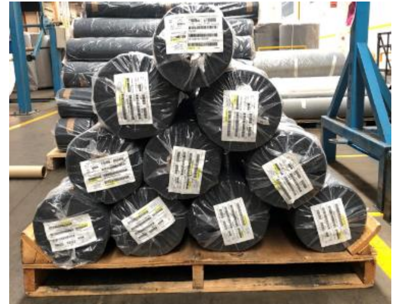
Vinyl 353.5 Kg