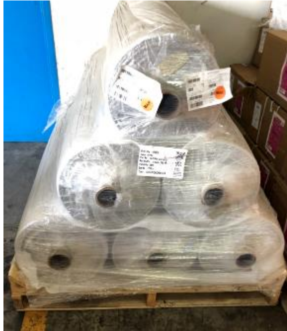
Vinyl 868.5 Kg